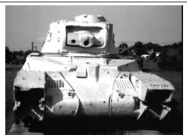
Nose-on view of the British A12 Matilda Infantry Tank Mark II parked at Aberdeen. Note the many angles making up the front of the tank. In the entries in this book, I used the armour thicknesses and angles I felt provided an aggregate value for the surface area noted.

Speed: The maximum road speed of the vehicle, in miles per hour. In practice this would vary from vehicle to vehicle, as one tank in a platoon would inevitably be a bit faster or slower than the others.